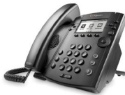
Polycom VVX 301/311