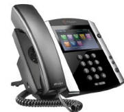
Polycom VVX 501