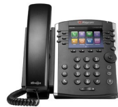
Polycom VVX 401/410/411